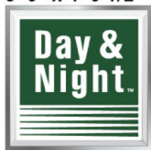
DEALER NAME HERE