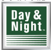
DEALER NAME HERE