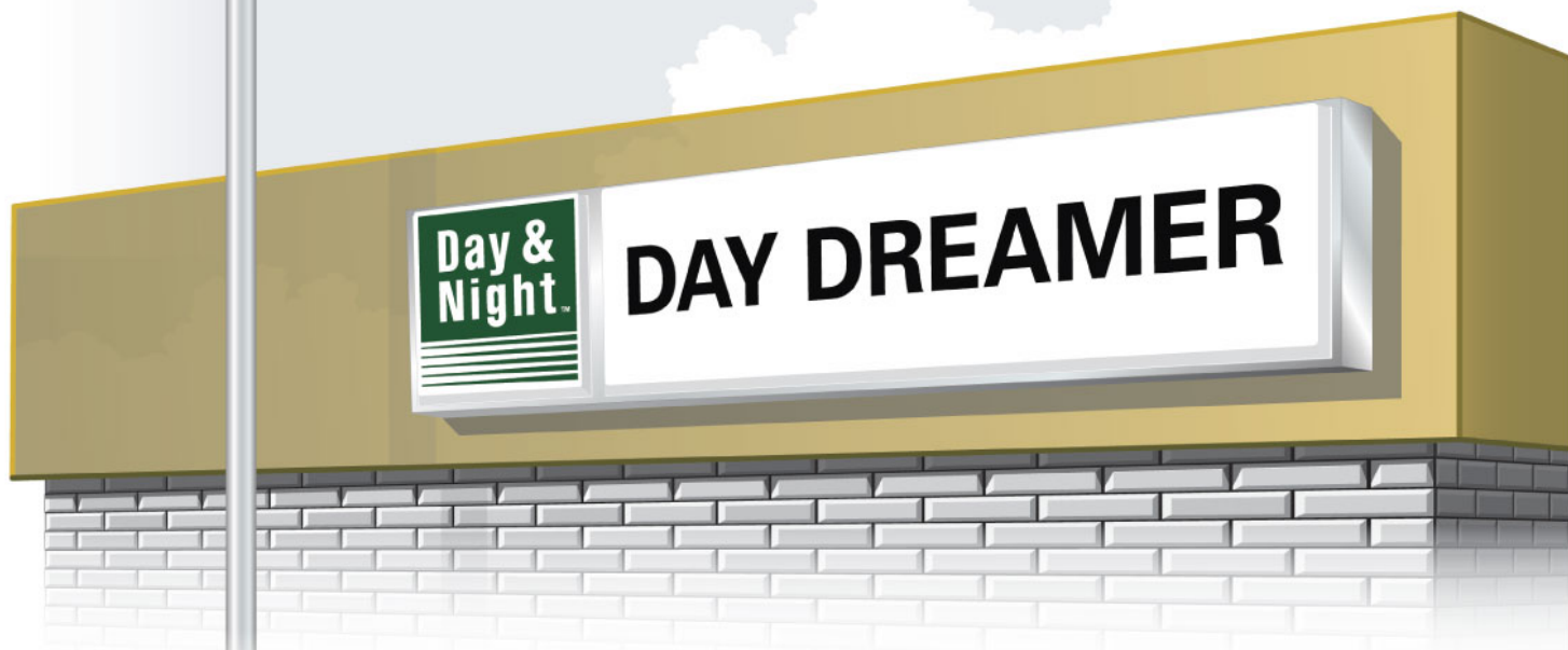
4'-0" x 4'-0 1/2"